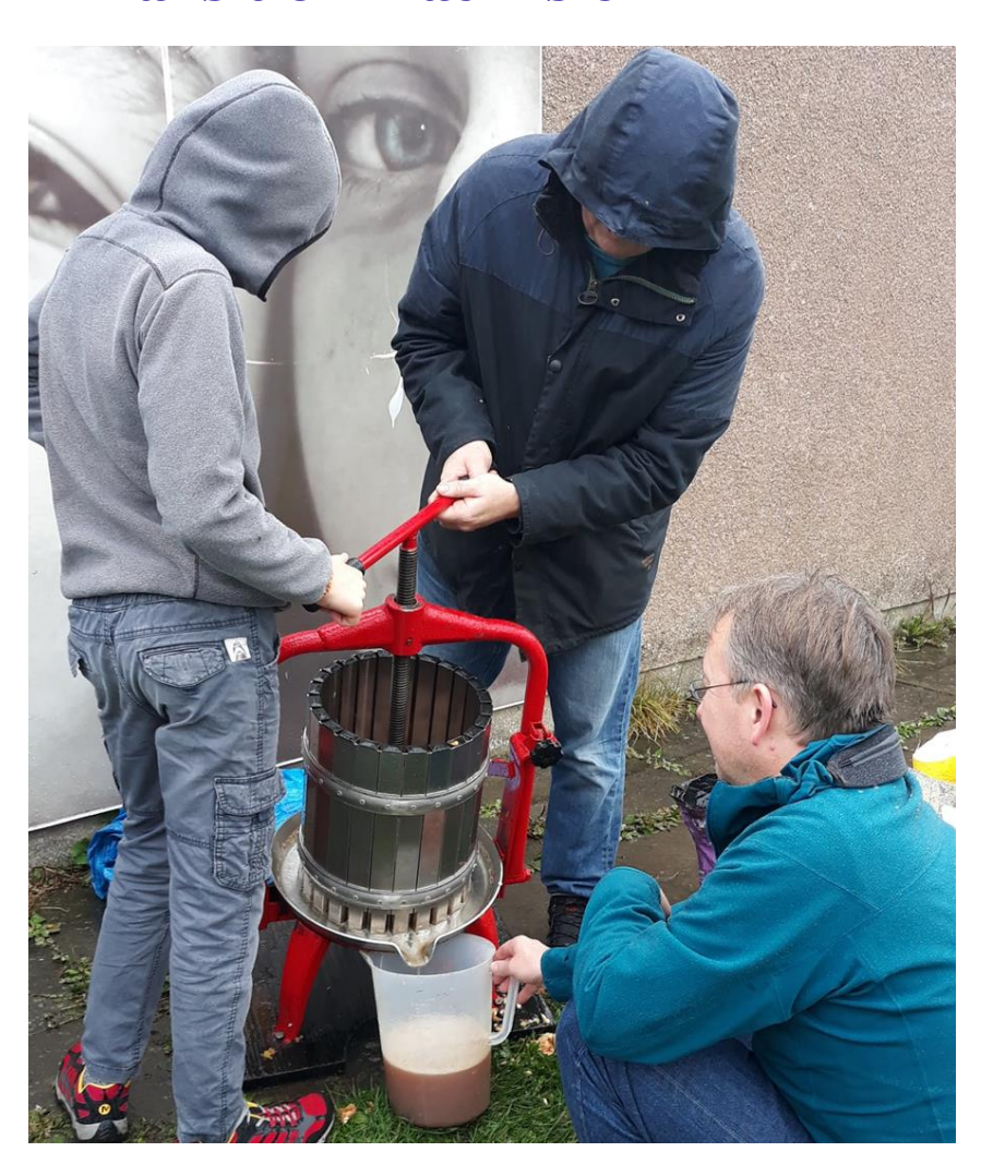
The TBI Apple press is coming to Cromarty and will be at the Community Market at the Victoria Hall on Saturday 14 October.