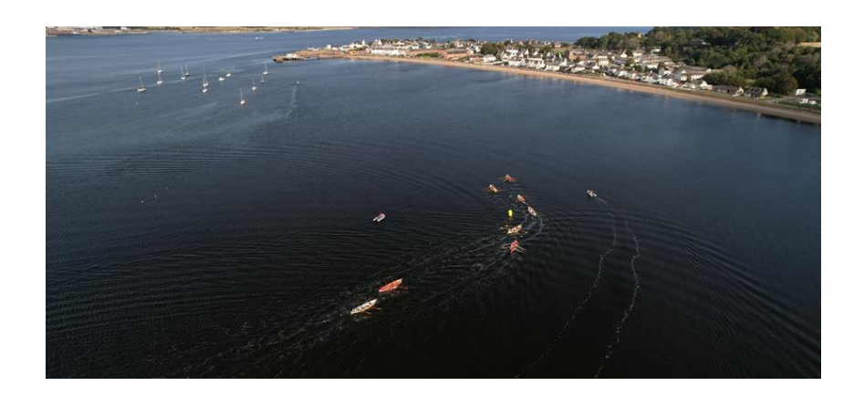
A superb aerial view of a rowing race in full flow.

September has been quite a month for local news and October looks to have plenty going on to fill the darker nights - so, pull up a chair and enjoy our autumnal read.